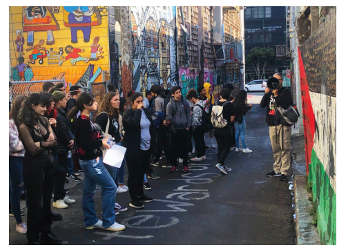
Your gift made this Mission District mural tour field trip possible